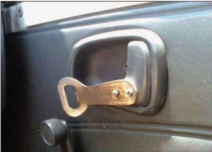
And your passenger can enjoy an adult beverage too!