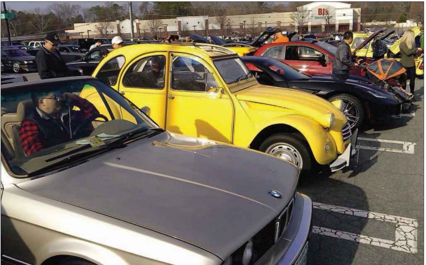
Cars & Coffee Richmond offers something for fans of almost every marque.