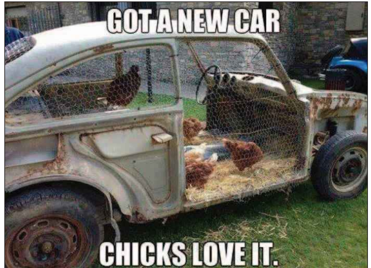
Cedric should have been suspicious when a friend offered him "a vintage German Coop" for $500.