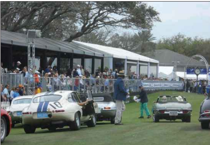
E-Type owners line up for the trophy presentation.

I am not someone who can afford to shell out $500 or $600 a night for a room at the host Ritz-Carlton resort on the Island, so I again made Kingsland GA my weekend headquarters. It is an easy drive from there across the Florida line to all of the Amelia events.