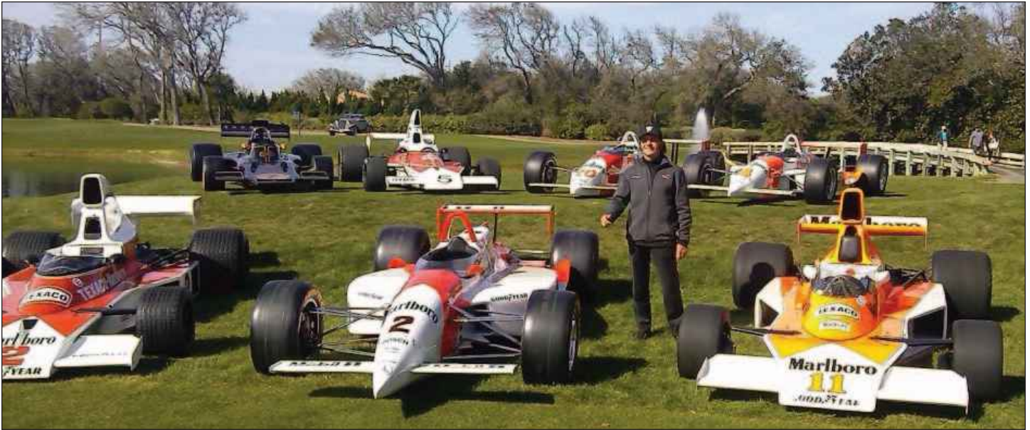
Racing legend Emerson Fittipaldi posed the day before the concours with some of the F-1 and Indy cars he drove during his long career.

Martini & Rossi Porsches and Lancias, which were also featured classes this year.