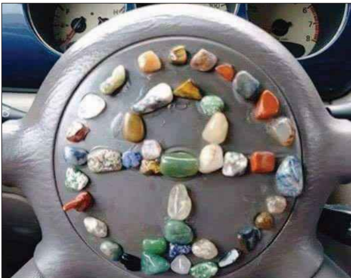
Penelope was quite proud of her decorative touch right until she rear-ended a bus and the airbag went off.