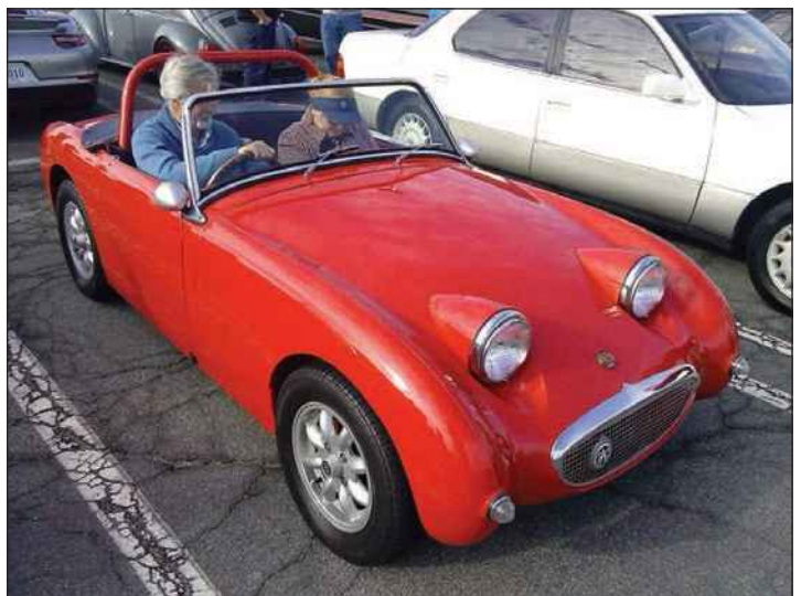
The owners of this bug-eye Sprite enjoyed a short burst of springlike weather in February.

It attracts hundreds of cars and car people. The cars range from American iron of all vintages to street rods, pickup trucks, muscle cars, Japanese rice rockets and street tuners