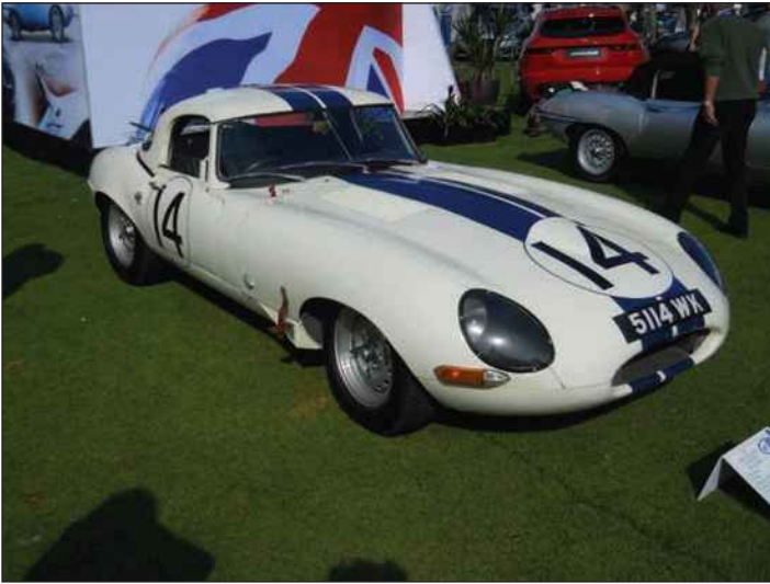
One of two lightweight racing E-Types as part of special display.