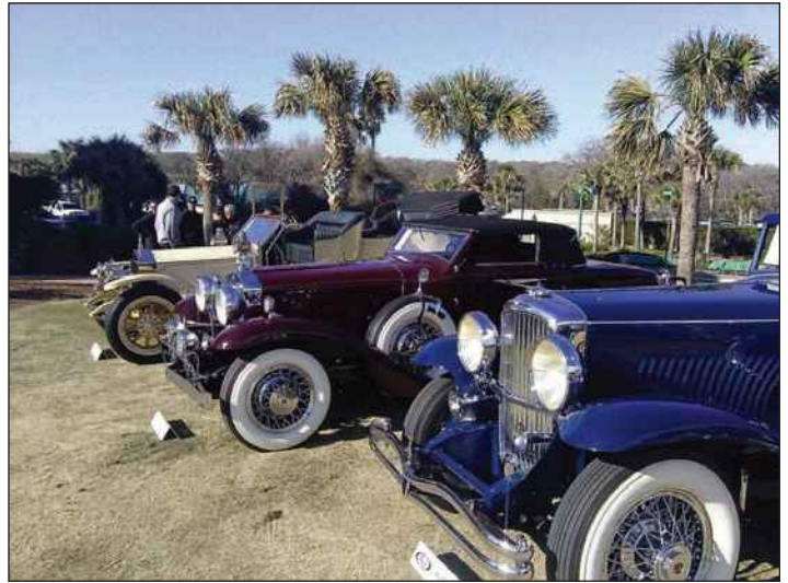
Classics line up for the auction block outside the RM-Sotheby auction hall.