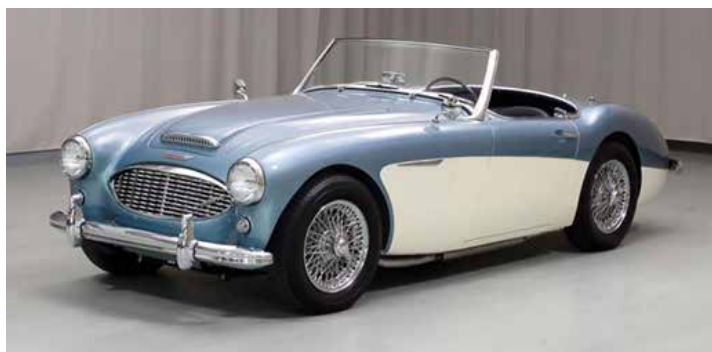
My research for a high school "Careers" paper included a spin in an Austin Healey 3000.

The magazine rack in our bathroom was crammed with professional journals Dad would cart home from work and peruse while on the can. My favorite was "Automotive Industries," which was founded in 1885 as "The Horseless Age," changed its name to "The Automobile" in 1909 and became "Automotive Industries" in 1917. It is still published. This publisher also put out the late, lamented "Autoweek," a motorsports standby that I subscribed to for