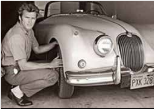
Young Clint Eastwood and his XK150.

Category III: Celebrities and their Jaguars mimicked by VJC Members