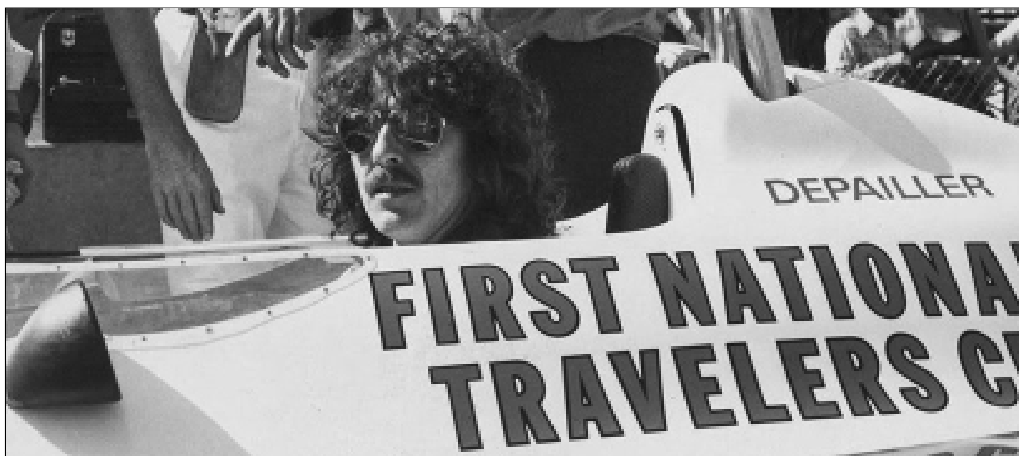
A dedicated Formula 1 fan, Harrison tries out the cockpit of Frenchman Patrick Depailler's racer.