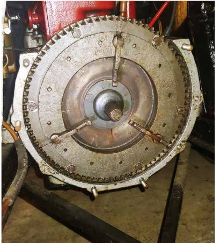
Closeup of Austin Swallow assembly.