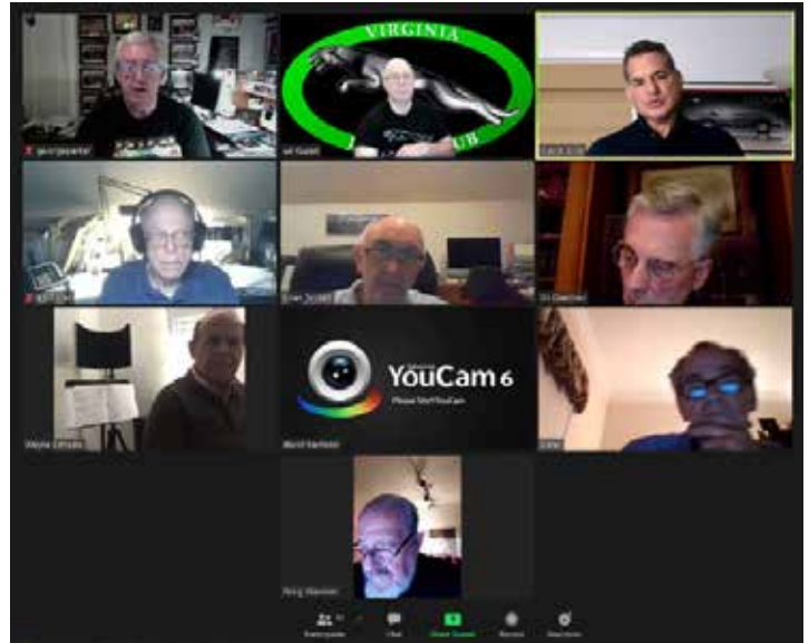
Zoom meetings seem to be the current method of face-to-face communications.