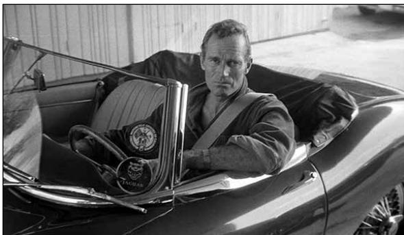
Charlton Heston in his XKE.