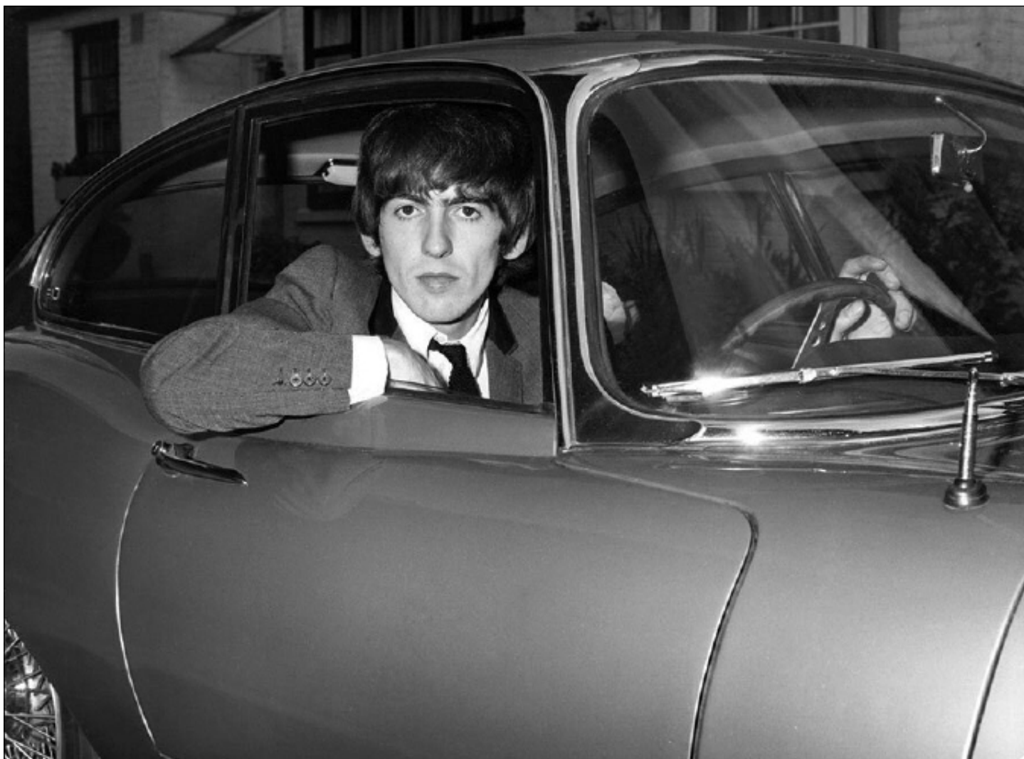
A young George Harrison behind the wheel of his Jaguar E-Type coupe.