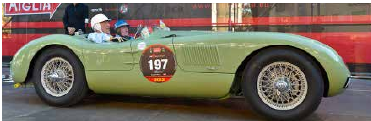
Moss and Dewis in Reims-winning C-Type at 2012 Mille Miglia reenactment.