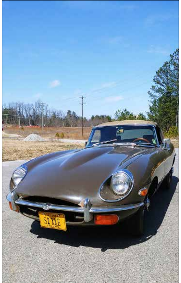
A long time in restoration, this E-Type is ready to enjoy.

The next sunny day I took the car out for a test drive. Bruce had replaced the twin Strombergs with the triple SU setup that Bill Lyons intended. The acceleration in the lower gears was breathtaking, and this is in a 52 year old car. No wonder the E-Type was a sensation in the sixties.