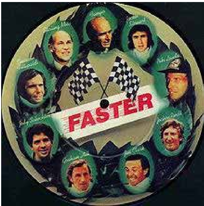
The recording of Harrison’s song, “Faster,” carried the photos of some of his favorite drivers on its jacket.

The supergroup to end all supergroups had a serendipitous beginning, so it’s fitting that they’re named after Harrison’s slang term for an accident. The word “Wilbury” was invented while he was working on 1987’s Cloud Nine with Jeff Lynne as co-producer. When confronted with recording errors caused by faulty equipment, Harrison would assure Lynne, “We’ll bury ’em in the mix.” The line was eventually shortened to “Wilbury,” a catch-all descriptor for minor performance mistakes and imperfections.