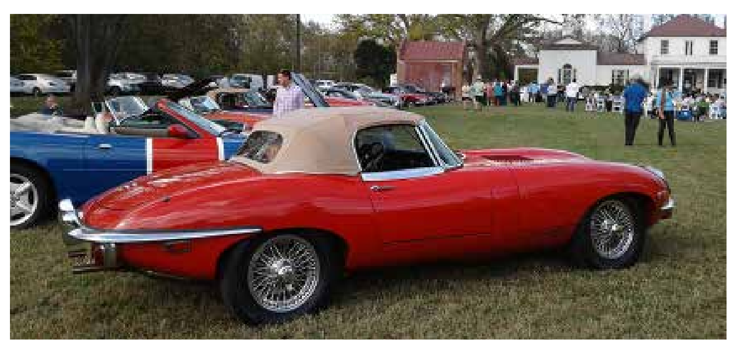
Although I had to read all the way through the "103 Coolest Cars" list, I just knew the exquisite Jaguar E-Type had to be on it.

Perhaps our Lyons Tales readers would like to compile