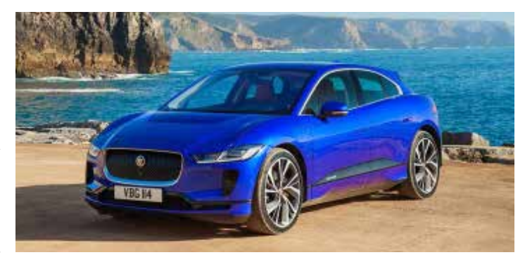
The Jaguar I-Pace fastback coupe has a muscular stance and a traditional grille opening, leaving the casual observe guessing at its mode of power.