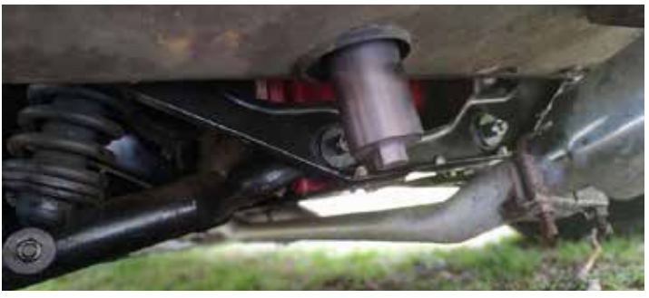
E-Type gas plug.

As of this writing the carbs do not drip and the car will start with a shot of ether but will not idle. I currently don't have the energy for a full carb rebuild and have taxes and other issues demanding my time, so will leave it at that for the moment. The car really went well the last time I drove her, the three SUs really do make a power difference, and they are normally easier to maintain than Strombergs. I still think the E Type throttle linkage is way too complex and prone to lost motion and sticktion. It's possible to buy