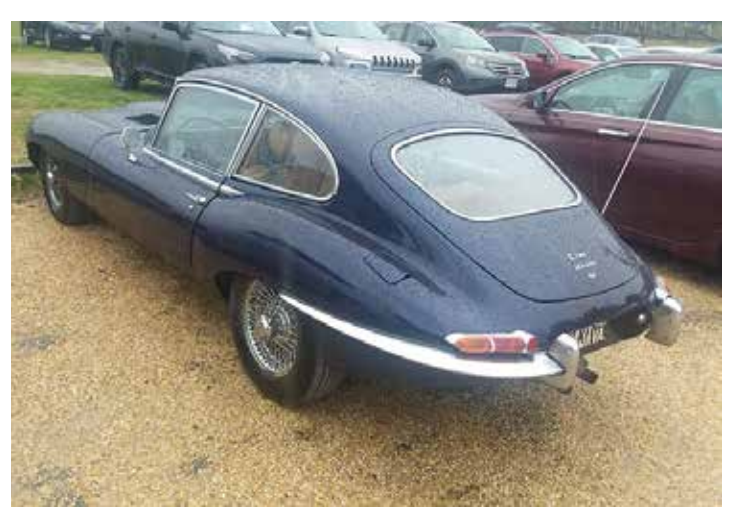
been doing regarding judges training. He advised us that stored XKE coupe to the AGM this year. The snug top came in handy in the rain.

A draft copy of proposed events for 2023 was handed out to the members.