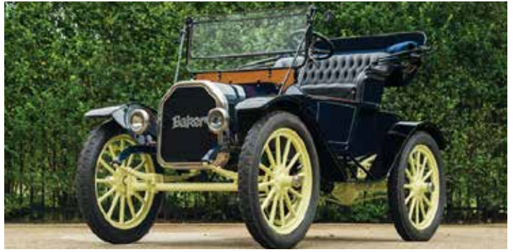
Baker Electric tried to imitate the look of internal combustion cars with this 1912 Model W Runabout.

For example, a 5-passenger Tesla Plaid <u>sedan</u> is faster than multi-million dollar Ferraris and Lamborghinis at a fraction of the cost. Add to that 4-wheel computer controlled dynamic drive and steering with CPU activated suspensions and electric cars also match or beat super cars around the