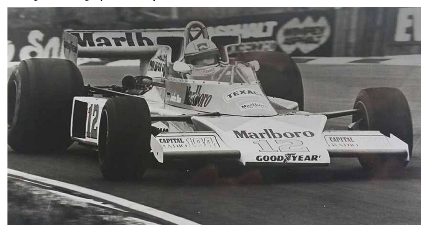
It was hard to miss the primary sponsor on this Marlboro McLaren from the mid-1970s. The cars functioned as rolling billboards and drivers' suits and trackside banners completed the package.